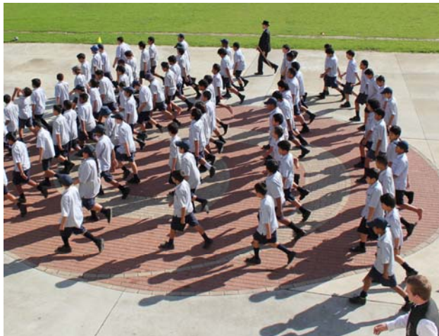
Above Left: Setting the scene, the Enterprise staff dress as their colleagues would have in the 1840's education system. Below: Our young ladies learning about good posture and etiquette in the 1840's. Above Right: Enterprise boys practice marching and saluting.