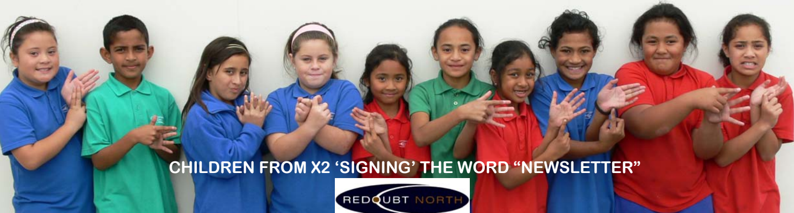
CHILDREN FROM X2 'SIGNING' THE WORD "NEWSLETTER"