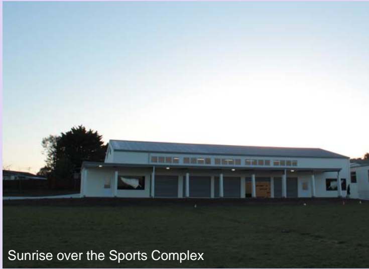
Sunrise over the Sports Complex