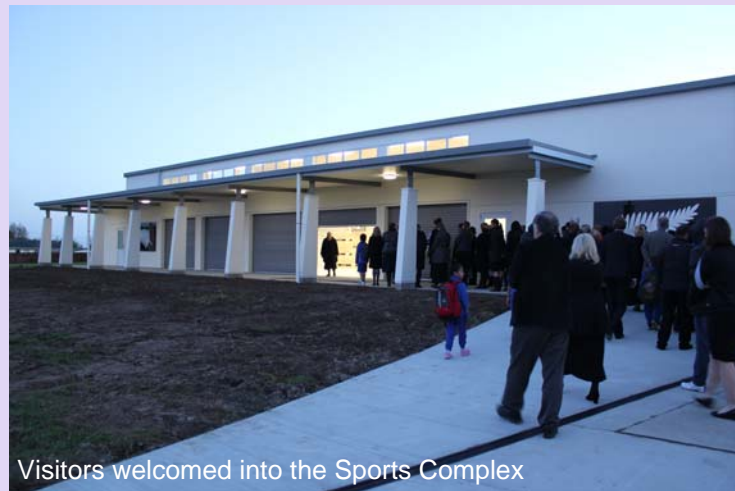
Visitors welcomed into the Sports Complex