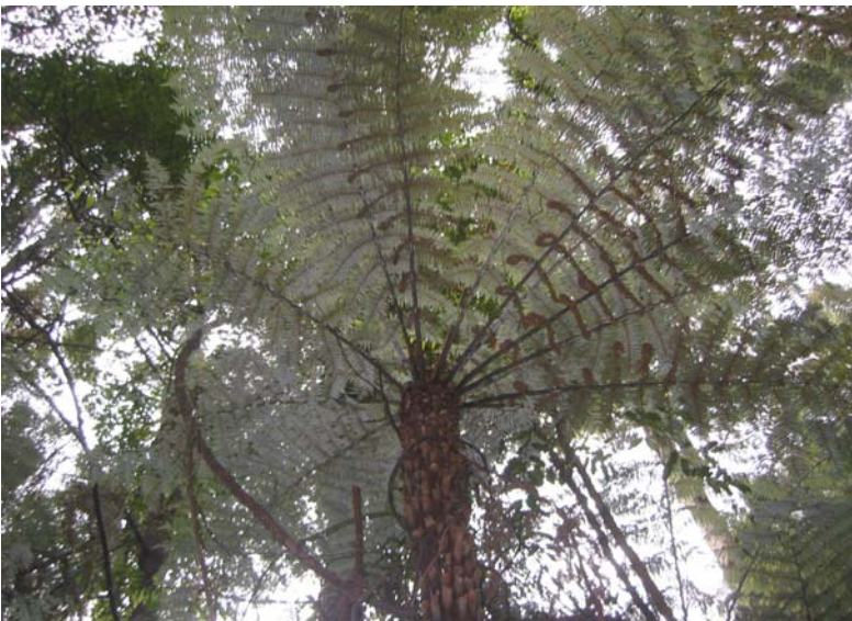
Children and Parents enjoying the Bush Walk