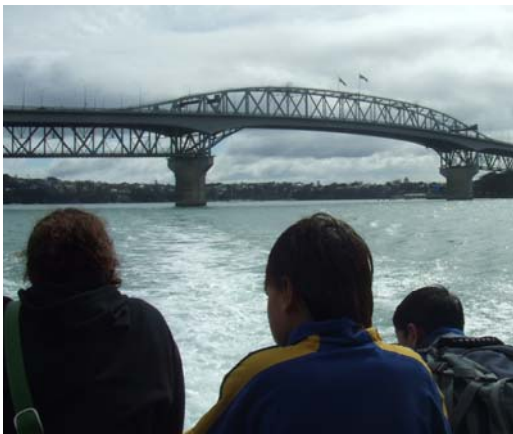
Enterprise children on their Ports of Auckland harbour cruise

In week 6 Enterprise students had a very busy time at Pasadena Intermediate. They were involved in a range of activities as part of their technology education. Lessons included food preparation, constructing, decorating and programming a cam activated toy, using the K-Nex to construct a simple beam and suspension bridge. They were also introduced to multi media software so that they could prepare a presentation about port operation and static structures. Besides all this, they had the opportunity to take a boat trip around the harbour. They observed the port operation in action and viewed from the underneath, the structure of the harbour bridge. It was a great experience.