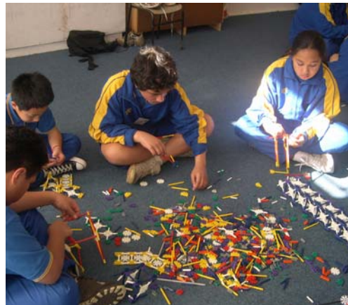
Using K-Nex to build a suspension bridge